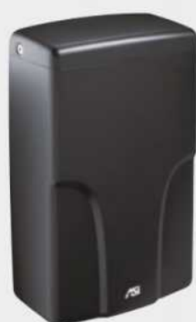
0196-41 TURBO-PRO™ HIGH-SPEED ADA HAND DRYER