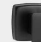
7340-41 SINGLE ROBE HOOK