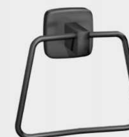
7385-41 TOWEL RING