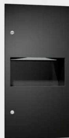
64623-41PC SIMPLICITY™ IN MATTE BLACK RECESSED PAPER TOWEL DISPENSER AND WASTE RECEPTACLE