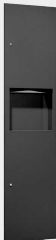
6467-41PC SIMPLICITY™ IN MATTE BLACK RECESSED PAPER TOWEL DISPENSER & WASTE RECEPTACLE