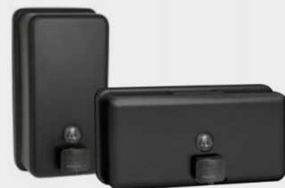
0347-41 VERTICAL LIQUID SOAP DISPENSER 0345-41 HORIZONTAL LIQUID SOAP DISPENSER