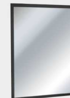
0600-41 INTER-LOK ANGLE FRAME MIRROR