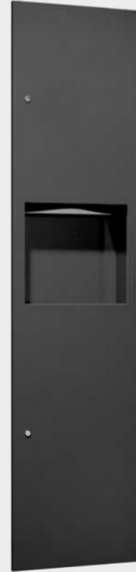
6467-41PC SIMPLICITY™ IN MATTE BLACK RECESSED PAPER TOWEL DISPENSER & WASTE RECEPTACLE