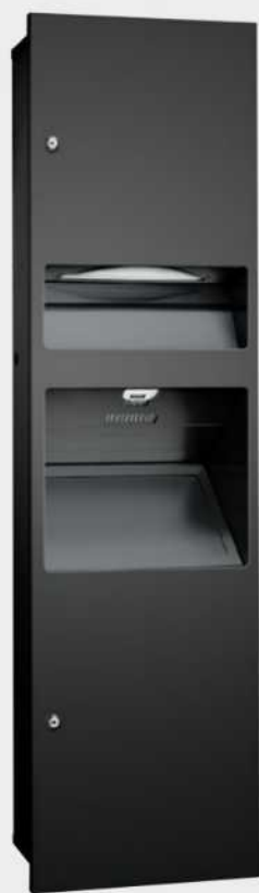
64672-41PC SIMPLICITY™ IN MATTE BLACK RECESSED 3-IN-1 CABINET—PAPER TOWEL DISPENSER, WASTE RECEPTACLE, AND HIGH-SPEED HAND DRYER* *purchased separately