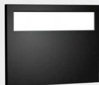
0477-SM-41 SURFACE MOUNTED TOILET SEAT COVER DISPENSER