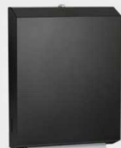
0210-41 SURFACE MOUNTED PAPER TOWEL DISPENSER