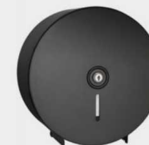
0042-41 JUMBO ROLL TOILET TISSUE DISPENSER