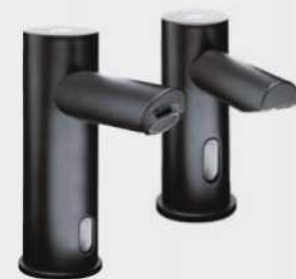
0397-1AC-41 EZ FILL™ WATER FAUCET 0394-1AC-41 EZ FILL™ FOAM SOAP DISPENSER