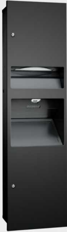
64672-41PC SIMPLICITY™ IN MATTE BLACK RECESSED 3-IN-1 CABINET—PAPER TOWEL DISPENSER, WASTE RECEPTACLE, AND HIGH-SPEED HAND DRYER* *purchased separately