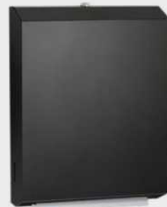
0210-41 SURFACE MOUNTED PAPER TOWEL DISPENSER