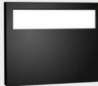
0477-SM-41 SURFACE MOUNTED TOILET SEAT COVER DISPENSER