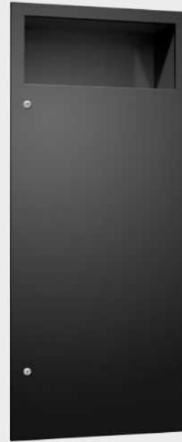
6474-41PC SIMPLICITY™ IN MATTE BLACK RECESSED WASTE RECEPTACLE