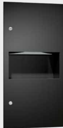
64623-41PC SIMPLICITY™ IN MATTE BLACK RECESSED PAPER TOWEL DISPENSER AND WASTE RECEPTACLE