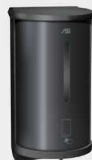
0362-41 AUTOMATIC LIQUID SOAP AND GEL HAND SANITIZER DISPENSER