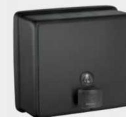
9343-41 LIQUID SOAP DISPENSER