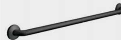
3801-41 STRAIGHT GRAB BAR