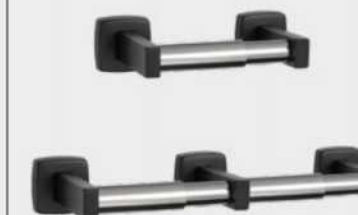
7305-41 SINGLE TOILET TISSUE HOLDER 7305-2-41 DOUBLE TOILET TISSUE HOLDER