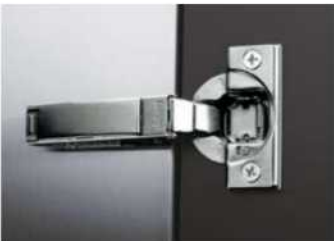
THREE WAY ADJUSTABLE HINGE

Each washroom accessory is designed to be completely recessed, lying perfectly in the plane of the washroom wall without any protrusion. The high-end door hinges, used to achieve this precise co-planar fit, are easily adjusted in the field. Phenolic doors in matte black or white, close silently and effortlessly and add an air of sophistication. All hinges are concealed and so is the internal latching system, leaving no visible hardware. This elegance of less subtly adds to your vision.