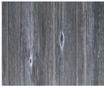
5 Year Exposure Wood