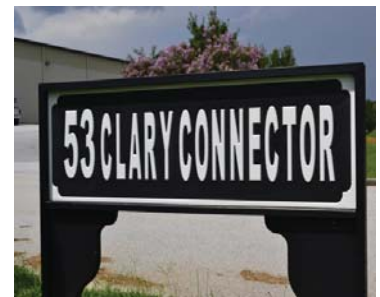
5 Year Exposure Sheet