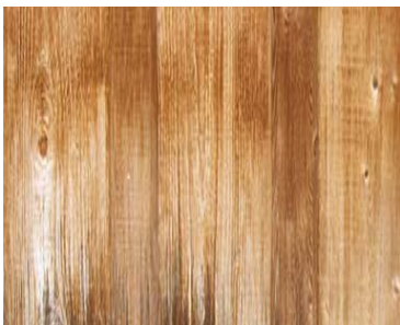
1 Year Exposure Wood