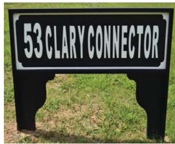
1 Year Exposure Sheet